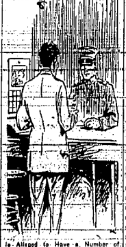
Alleged to Have a Number of Allies.

Auto-Repairing! Expect Best Guaranteed PRICES REASONABLE Our Specialty Bobber & Tucker 1001 N. 2nd Street, Twin Falls, Idaho