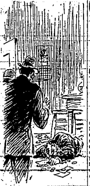
Found Him Lying Unconscious.