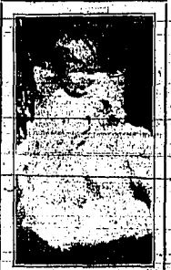
LITTLE JACK PALMER Before Making the Adjustments