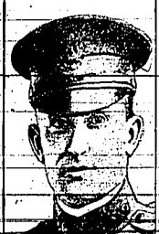
Captain Ty Cobb.

"The game means to me more in August, G. and, just up for several months," said Cobb. "I intend to break away from baseball. I'm tired of it. I've had 15 years of it, and I want to quit while I'm still good. There is the danger that the franchise