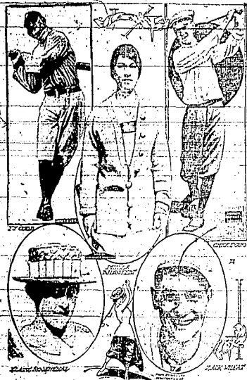
Practically all branches of sport were continued last year despite the war...