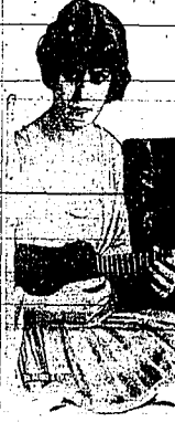
BEAUTY FROM THE SOUTH