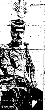
MINISTER FROM SERBIA