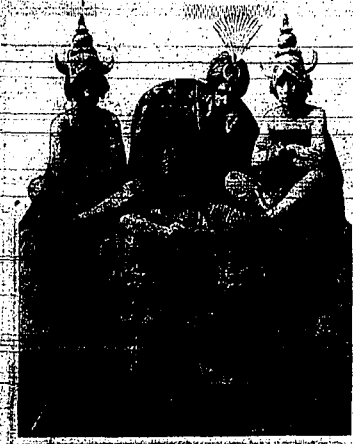
ALEXANDER THE GREAT AT LAVERG