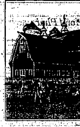
Plan of Combination Dairy and Horse Stable.

"Better barns mean better and more productive cows." This is the opinion of the successful business farmer. Cows are raised on a dairy farm, and they have been in the history of the dairy industry in America. A good producer of milk is a good producer of a good product. The ideal structure for a farmer is a building which will house the live stock under one roof.