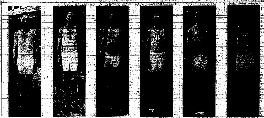
Twin Falls High School Basketball Team Winners of the Southern Idaho Championship This Year