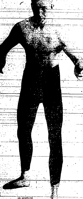
Argentine Middleweight Champion Who Will Clash Officially on the Mat at the Lattin Theatre Tonight

How many young men can do now. How many young men can do now. How many young men can do now.