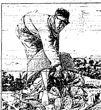
This Picture, Taken by the Dominion City Health Department, Illustrates How Milk Bottles Are Thrown Away by Consumers—Practically as Inexpensive as Wasteful and Adds to the Cost of Milk.

Over a million of these staggering wastes of milk bottles in the United States are annually discarded as rubbish by the consumers, adding millions to the cost of distribution, as a factor in the price of milk, and in the cost paid for by consumers? To answer this question and determine ways of remedying the situation, specialists of the United States Department of Agriculture made an investigation. The investigation showed that the average milk bottle is short-lived. It is used only about 17 times before it is broken or lost, the special study of the dairy consumer who has a quart milk delivered at the door each day, the dealer in the course of a year has to supply 200 bottles. The investigation, conducted in 85 cities, shows that the average milk dealer buys 17,500 new bottles a month and the dairymen lose more than 100,000 a month, which are largely, though not entirely, replaced each month. Junk Dealers Profit Of the cities studied, the investigation shows that $200,000 worth of bottles are collected annually from the cities shown. In some cities, the bottles are carried on by the junk dealer.