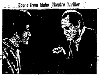
Scene from Idaho Theatre Thriller