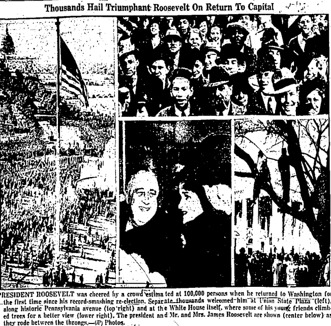
Thousands Hail Triumphant Roosevelt On Return To Capital