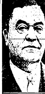
JOHN RINGLING, king of the big top and last of the seven Ringling brothers, succumbs to pneumonia at his Park Avenue home...