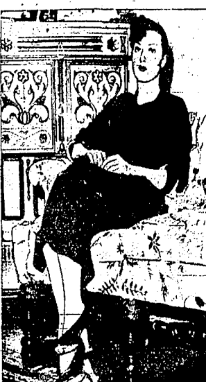
GYPSY ROSE LEE, the former burlesque queen who "slip-leaved" her way into a New York musical comedy, performed the most expensive "slip" act of her career when six men robbed her of jewelry she said was insured for $25,000...