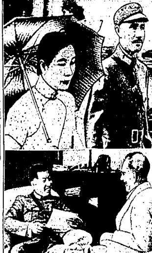
MR. CHIANG-KAI-SHENG, shown at top with her husband, Generalissimo Chiang Kai-shek, won a three-day armistice in China's civil strife, after flying with her brother to the headquarters of Marshal Chang Hsueh-fang's headquarters, where the nationalistic "strong man" was held prisoner. Marshal Chang is pictured below with W. H. Donald, freight Australian adviser to Chiang Kai-shek, who has been trying to effect the latter's release.

It is with this part of the Foundation's work leaders of the campaign said that the endorsement features will be concerned chiefly. Doctors from throughout the world they added, look to the Foundation for the latest developments in the fight against the disease. The Foundation also has established and wants to establish more clinics in places other than Warm Springs to aid in treatment of persons suffering from the disease. The Foundation operates on a nationwide basis. Geoplans are being asked to make the initial endorsement contribution because the movement began in their state.