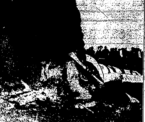
An amateur photographer who was an eyewitness of the crash of a Braniff Air Lines plane that killed six men at Dallas, Texas, snapped this picture at the height of the blaze just a moment after the air liner crashed to the ground.