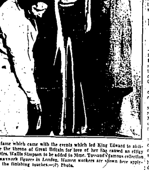
Mrs. Simpson in Waxworks

Scraping all its equipped moulds depicting Edward VIII, a London firm is busy today preparing tens of thousands of banners for the coronation.