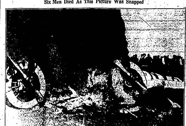
An amateur photographer who was an eyewitness of the crash of a Braniff Air Lines plane that killed six men at Dallas, Texas, snapped this picture at the height of the blaze just a moment after the air liner crashed to the ground.