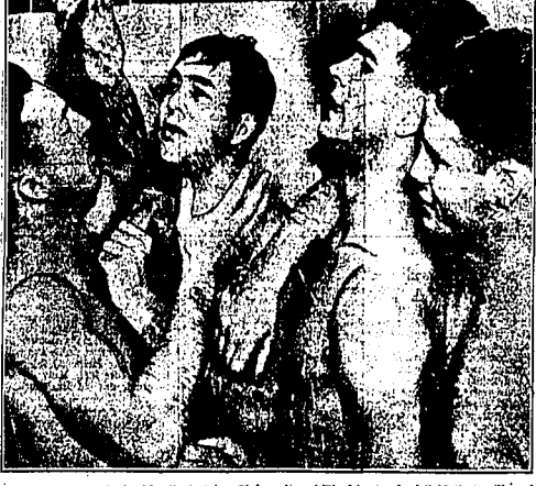
HERE is that redoubtable first-string University of Washington backfield that will pack the ball against Pittsburgh in the Rose Bowl New Year's Day having a fine frolic under the showers after a strenuous workout at the Huskies' training camp at Santa Barbara.