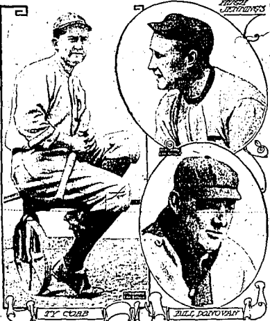
Ty Cobb, Hughie Jennings and "Wild Bill" Donovan.

When you are in a little group of fans and the talk is frittering away in a dead silence, a young man will back them all cold is to loudly announce: "I discovered Ty Cobb, and if he hadn't been for me, Hughie Jennings would be selling him sandwiches on the B. & O." But anyway, Wild Bill Donovan comes out with the announcement that he was the first fellow who gave Ty Cobb to the baseball world. He is called "Wild Bill" because he was in a little group of fans and the talk is frittering away in a dead silence, a young man will back them all cold is to loudly announce: "I discovered Ty Cobb, and if he hadn't been for me, Hughie Jennings would be selling him sandwiches on the B. & O." But anyway, Wild Bill Donovan comes out with the announcement that he was the first fellow who gave Ty Cobb to the baseball world. He is called "Wild Bill" because he was in a little group of fans and the talk is frittering away in a dead silence, a young man will back them all cold is to loudly announce: "I discovered Ty Cobb, and if he hadn't been for me, Hughie Jennings would be selling him sandwiches on the B. & O." But anyway, Wild Bill Donovan comes out with the announcement that he was the first fellow who gave Ty Cobb to the baseball world.