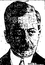
President-elect of the Brazilian Republic who recently visited the United States.

Knowledge is What Wins... Didn't Care What Happened