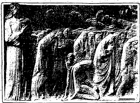
Illustration with Christ in the foreground and weeping at the procession of Belgian widows and orphans passing by. This conception of the tragedy of Belgium is by Charles Keelton of New York City, Italian sculptor, and, cast in bronze. It will be presented to Cardinal Mercier by a committee of New York Catholic priests when the Belgian prime minister is due to America.

Every Letter is Used. In the record of brands, every letter of the alphabet is represented, and most letters are found in three or four positions. An exception is "O," which has but one position, in any position, and therefore can be used only once. True, there is the "O" flattened at the side, but it is then called a "mailed" "O" and is not counted as a letter. "N" is another letter that is not susceptible of many positions, for horizontally it is "Z." "F" is another letter with a limited use, except in combination with other characters, and is usually called a bar. "C" and "E" are examples of letters that are used in four positions. For example, an ordinary "K" makes one position. Turn it to an angle of 45 degrees and you have the "mushroom" "K"; on its back, horizontally, the "lazy" "K"; and reversed, a fourth position. There are lazy and tumbling brands with a limited use, except "P" and "L." But when the cattle business has become general and instead of 100 ranches there are thousands, new