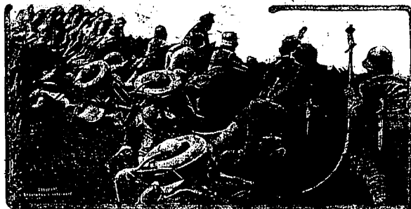
The allies look with considerable suspicion on the new volunteer army that Germany is recruiting and training in modern methods of warfare. The photograph shows some of the recruits being taught the use of liquid fire.