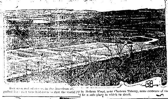
Below you see the graves in the American cemetery in Belleau Wood, near Chateau Thierry, note evidence of the ground that were hidden so that the world might be a safe place in which to dwell.