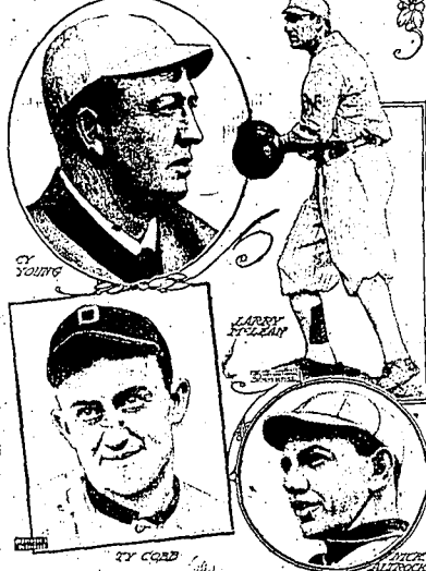
Ball Players Who More Than Made Good in Fast Company.

There is a rumor that the Prince will be in the city for a long time. He will be in the city for a long time. He will be in the city for a long time.