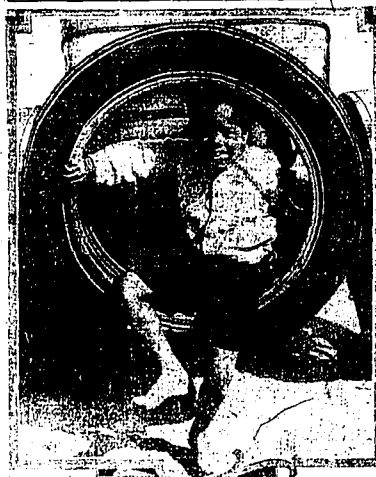
The new Diamond Cord Tire is black as the pickaninny