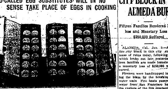
Avoid Using Egg Substitutes, Which Usually Are Unsatisfactory.

Prepared by the United States Department of Agriculture. The so-called egg substitutes which usually come in packages are being sold to housewives with no sense (take the place of eggs in baking or cooking) say the specialists of the United States Department of Agriculture. They have analyzed and made baking tests with most of the preparations used in the market by manufacturers to do the work of eggs.