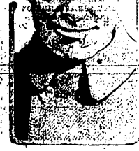
Coach Fielding Yost.

Year has been coaching at Michigan since 1910. In that year he coached the team for the first time in 1910. In 1911 he coached the team for the second year. In 1912 he coached the team for the third year. In 1913 he coached the team for the fourth year. In 1914 he coached the team for the fifth year. In 1915 he coached the team for the sixth year. In 1916 he coached the team for the seventh year. In 1917 he coached the team for the eighth year. In 1918 he coached the team for the ninth year. In 1919 he coached the team for the tenth year. In 1920 he coached the team for the eleventh year.