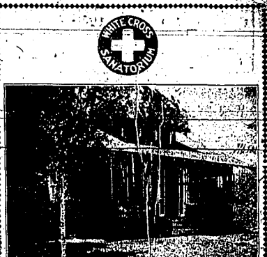
The Only Modern Chiropractic Hospital on the Tract 161 THIRD AVE. NORTH PHONEX 388-W