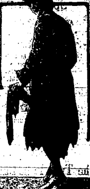
An out-of-the-ordinary dress of gold tissue embroidered with yellow woad to a 'plaid' design trimmed with lustrous tulle, producing a stunning effect. The exquisite paradise is gilded and puts a charming finishing touch on this unusual creation.

The council of premiers today discussed the diplomatic situation and the peace treaty with Turkey. It decided to allow Hungary an extension of eight days in which to give her reply to the peace treaty presented by the allies.