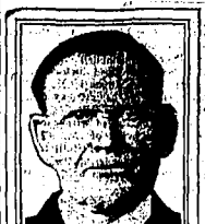
Portrait of a man, likely related to the 'Public Forum' section.

Employing only the best mechanics in Idaho. Our Acetylene Welding Department is prepared to take care of any work in this line. The largest outfit in Southern Idaho enables us to turn out more work and at shorter notice than un-equipped shops.