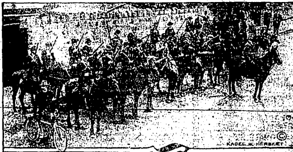
Clashes between the Irish upholders of the "republic" and the troops and police stirred daily occurrences, and often are serious. The photograph shows a body of the mounted national volunteers known as emergency troops.