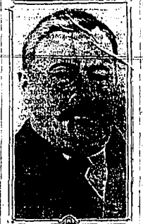
SEN. JOHN PENROSE Who may have his hands full trying to tell Johnson, Wood, et al, how to behave.