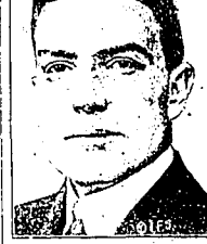
Mr. Rockefeller recently had an altercation with a Denver photographer who persisted in taking pictures of the Rockefeller's children.

PHOENIX, Ariz., Aug. 10.—If a bolt of lightning should strike the tent tonight, two men may be ready for the sky. The tent was struck by lightning and two men were killed.