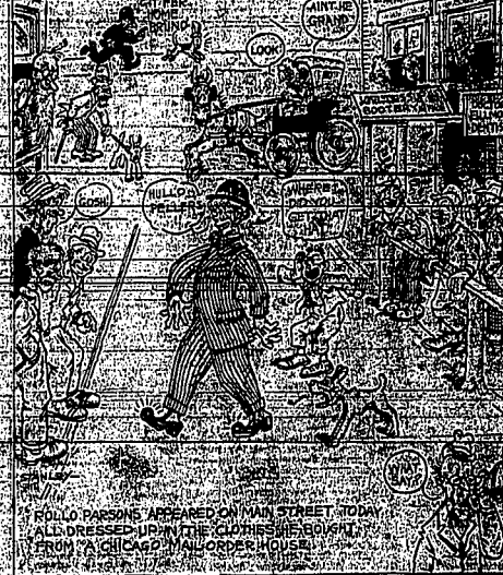
FULLY DRESSED UP ON MAIN STREET FROM ALL DRESSED UP IN THE GAMBLES BOVINS FROM YACHT CLUB AT WARD HOUSE.

ONLY TWO FINDS ON MAJOR TEAMS St. Louis Cardinals manager Branch Rickey today announced that he had found only two players who would be available for the 1934 season. Rickey said that he had found only two players who would be available for the 1934 season. Rickey said that he had found only two players who would be available for the 1934 season. The Cardinals' lineup for the 1934 season is expected to be one of the best in the league. Rickey said that he had found only two players who would be available for the 1934 season. Rickey said that he had found only two players who would be available for the 1934 season.