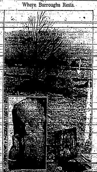
Where Burroughs Resists