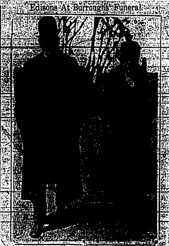
Edisons At Barron's Funeral