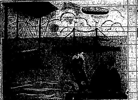
United States Fleet, as shown making a full day's run from Hampton Roads, Va., to the Atlantic coast.

BOTH CLAIMING EARLY VICTORY IN SEA STRIKE OSCAR