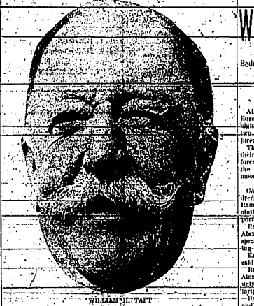
WILLIAM H. TAFT

Washington, May 23.—President Taft's greatest ambition is to be appointed to the Supreme Bench of the United States. He has expressed a strong desire to serve on the highest court in the land. His appointment would be a significant achievement in his career.