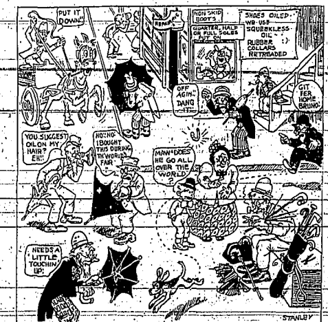
THE UMBRELLA MAN SAYS IT WILL TAKE ANOTHER HARD WINDSTORM TO BRING THIS SPRING'S BUSINESS UP TO LAST YEAR'S

Don't let a single gobbler get away from you today.