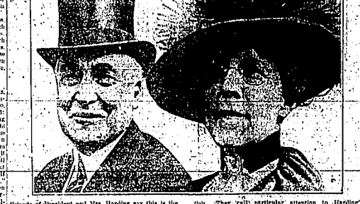
Friends of President and Mrs. Harding say this is the best photograph of them taken since the inauguration.

The photograph shows President Woodrow Wilson and Mrs. Woodrow Wilson. They are both smiling and appear to be in a relaxed setting. The photograph is a remarkable camera study of the Hardings. It captures a moment of joy and companionship between the President and his wife.