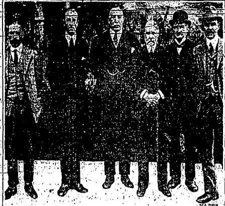
IRISH PEACE CONFERENCE... This is the first photograph to reach America showing the Irish cabinet members...