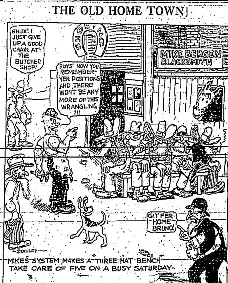
MIKE'S SYSTEM MAKES A THREE HAT BENCH TAKE CARE OF FIVE ON A BUSY SATURDAY.

What strange machinery for protecting the rights of the people!