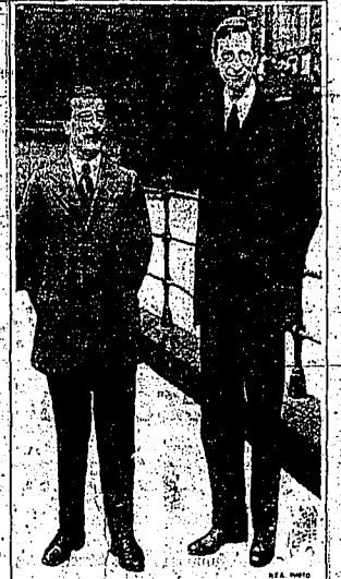
IRISH PEACE CONFERENCE... This is the first picture from the Irish peace party to reach America...