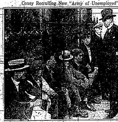
General Coxy is recruiting another 'Army of the Unemployed' here by interesting unemployed to form 'unemployed'...

First game: The H. P. O. and the C. O. B. 7-6. Second game: The H. P. O. and the C. O. B. 7-6.