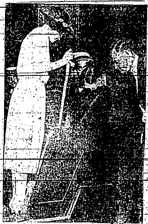
X-RAY ENDS TIGHT SHOE HORROR—Here's the new nail and the shoe salesman, installed in a Philadelphia store. The purchaser looks down through the machine and finds out whether the new shoe is tight or the old one is.

He said that he had seen Maharg in the clubhouse at the time of the 1918 world series.