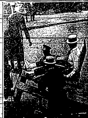
OFF FOR THE GAME—A wheel chair, a couple of plaques and a motor truck have solved the problem of getting disabled veterans to baseball parks and theaters. The plaques of Columbia originated the idea in 1925. This wonderful thought is being "boosted" from Twin Falls hospital to the Falls region.