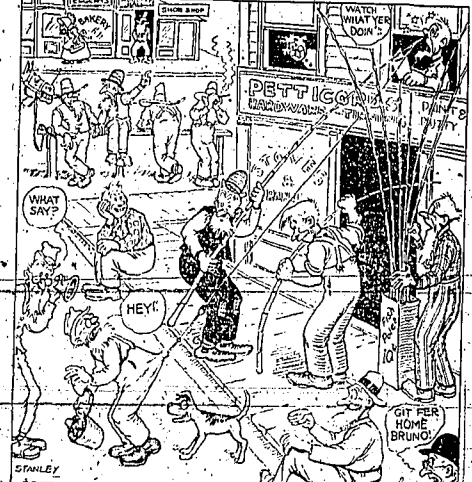
PETTICOR'S STORE JUST RECEIVED A NEW SHIPMENT OF UP TO DATE FISHING TACKLE