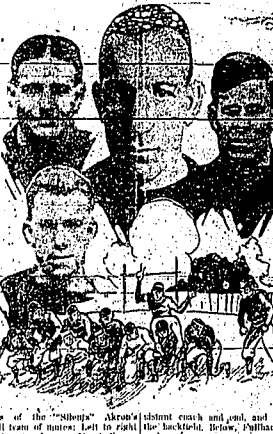
Illustration of a football game in progress, showing players running with the ball.