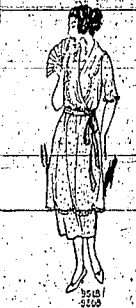
A-LOVELY OGDEN. This gown is for the smart effect. Fashion your own evening frock after this model. The blouse features a lace collar of white, and the skirt is of a lovely purple silk.

LAURENCE, Ind., Sept. 10.—Laurance, Ind., has been selected as the site for a new wire mill. The mill will be built on a 100-acre tract near the town of Laurence. The mill will be owned and operated by the Laurence Wire & Cable Co.