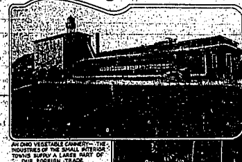
AN OVERSEAS VEGETABLE CANNERY, THE HUB OF THE SMALL AGRICULTURE OF THE WESTERN UNITED STATES.

As a result of the war, this country has been forced to look for the interior bank to supply the necessities of life. The interior bank is the only one that can supply the necessities of life. The interior bank is the only one that can supply the necessities of life.