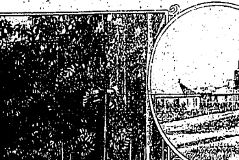
A TYPICAL MIDDLEWEST BOARD OF COMMERCE BUILDING THROUGH COOPERATION WITH THESE DISTRICTS THE LOCAL BANKS ARE AIDING BUSINESS MEN IN WORLD REORGANIZATION.

As a result of the war, this country has been forced to look for the interior bank to supply the necessities of life. The interior bank is the only one that can supply the necessities of life. The interior bank is the only one that can supply the necessities of life.