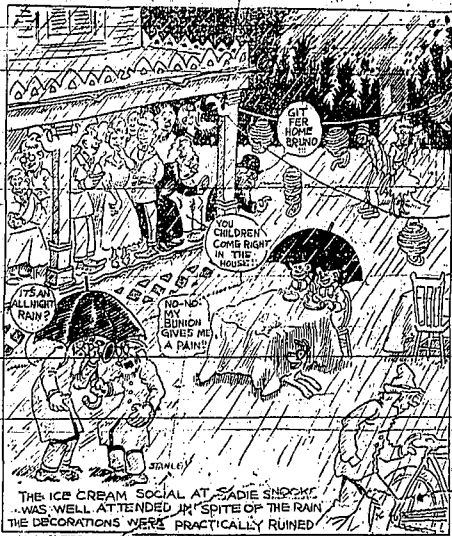
THE ICE CREAM SOCIAL AT SADDIE SNODGRASS WAS WELL ATTENDED IN SPITE OF THE RAIN THE DECORATIONS WERE PRACTICALLY RUINED