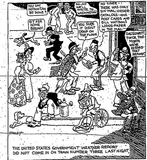
THE UNITED STATES GOVERNMENT WEATHER REPORT DID NOT COME IN ON TRAIN NUMBER THREE LAST NIGHT