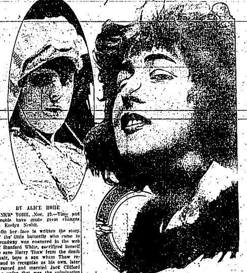
SIXTEEN YEARS AGO SHE WAS THIS BEAUTIFUL GIRL. TODAY SHE IS THIS BEAUTIFUL GIRL. THE DIFFERENCE IS ONLY SIXTEEN YEARS.