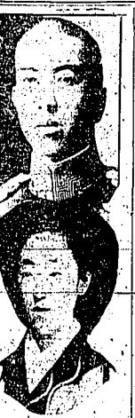
CHOW'S PRINCESS INGHO AND HIS WIFE—PRINCESS SAKI

Washington, Nov. 25.—The British press today agreed with the grand talk given by Lord Curzon, secretary of state, that the world will not prevent another great military power in Europe.