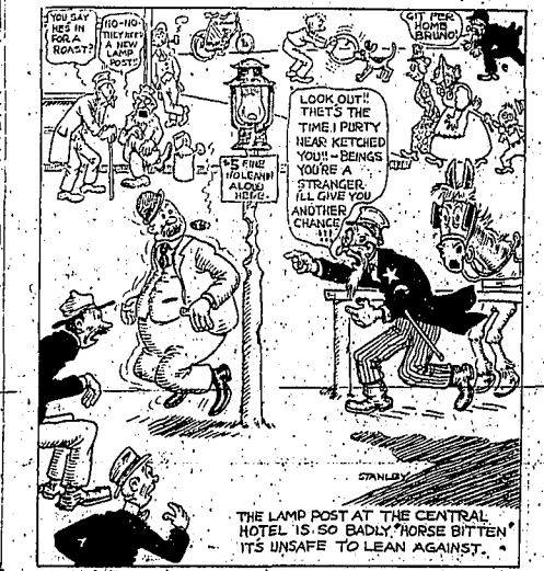
THE LAMP POST AT THE CENTRAL HOTEL IS GOING BADLY 'HORSE BITTEN' ITS UNSAFE TO LEAN AGAINST.