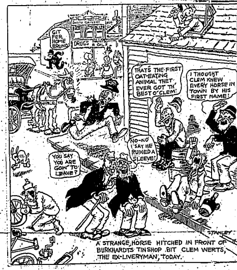
A STRANGE HORSE HIT IN FRONT OF BURKARD'S TINSHOP BY CLEM WERTS, THE EX-LIVERYMAN, TODAY.