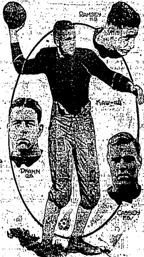
ITHACA, N. Y., Nov. 28—Cornell is alive for victory over Pennsylvania on its great backfield, plus Thanksgiving day. The Twins club will be given the water by the Twins club.