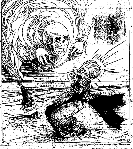
THE FISHERMAN AND THE GENIE