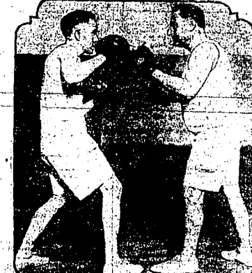
Congressman Vincent M. Brennan of Detroit left over that his bouts with Congressman Arthur B. Froo of San Jose, Cal., are never. Capitol Jones. Brennan is lightweight champion of the U.S.A.