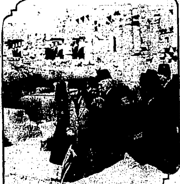
The Khedive of Egypt, wearing arid suit is shown here visiting the ruins and unexcavated tomb of the ancient King Tutankhamen, the discovery of which was the greatest of the kind in the history of art.

their toilet in her presence, no let us be considerate of their feelings and perform our toilet only in privacy.