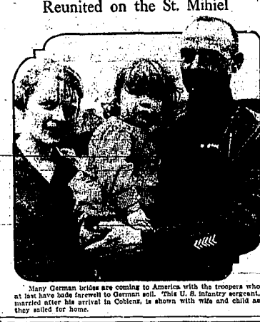
Many German brides are coming to America with the troops who at last have been allowed to return home.

That helps to explain the popularity of Shredded Wheat. It's an all-round food—equally delicious whether you feed it to a child or a horse.