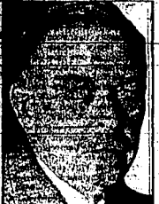
DR. HUBERT WORK

WASHINGTON, Feb. 13.—President Harding has named Dr. Hubert Work as secretary of the interior, succeeding Albert B. Fall.