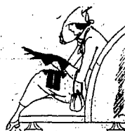
GLOVES BY VAN RAALTE

W. H. Wright & Sons Co. has been in business for 48 years. During this time a policy of fair treatment, of small profits, of aggressive merchandising has been the biggest factor in our growth. We know that the public is the best judge of quality and price, and at all times it will be our aim to sell quality merchandise at prices the public knows to be right. You may rest assured we intend to build a fund of good will for it means our ultimate success.