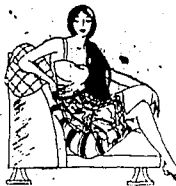
THE NEW WRAP AROUND COBRET

We have given more room to the lace department. You will find the newest, the cleanest stock of laces ever shown. Berthas, collars and cuff sets, edges, etc. Moderately priced.