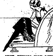
NICE THINGS YOU LIKE TO WEAR

Some of the newest patterns shown in America, in both sweet finish and in silk. Clever novelty gauntlets, the kind seen on Fifth Avenue today such wonderful quality. Reasonably priced.