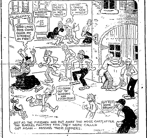
JUST AS THE FIREMEN HAD PUT AWAY THE HOSE CART AFTER THE BARREL FACTORY FIRE THEY WERE CALLED OUT AGAIN - MISSING THEIR SUPPERS.