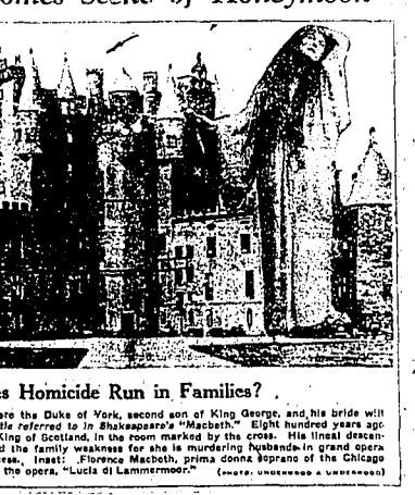
Does Homicide Rank in Families? Glamis Castle, Scotland, where the Duke of York, second son of King George, and his bride will honeymoon.