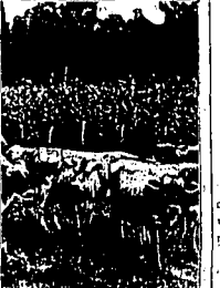
Use of Purebred Females is on Rapid Increase.

When farmers adopted the plan to beat their herds and flocks it is not long before the percentage of purebred females increases noticeably.