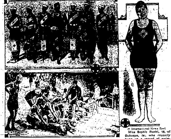
Upper—The creek Jacksonville, Fla., Red Cross Life-Saving Corps which has been organized by Commodore W. E. Longfellow, national field agent of the corps.

Lower—Red Cross Life-Saving experts at Long Pond, Plymouth, Mass., giving instruction in modern methods of resuscitation of persons rescued from the water.