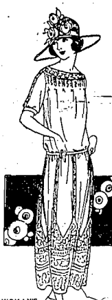
WOMAN'S INSTITUTE Fashion Service